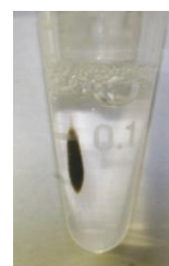
Before separation After separation